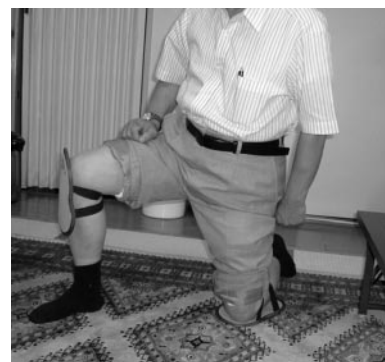
Fig. 12. Improvement in the bending posture while washing a patient's body by using knee pads.

Figure 13 shows the improvement in washing vegetables. By making a washing plate, and putting it in the sink, the work height in washing is raised and the workers' posture