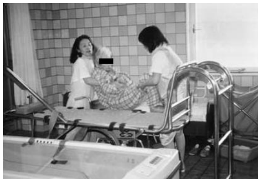
Fig. 1. Transferring a patient between a washing-body stretcher and a bed.