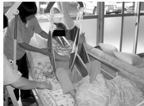
Fig. 11. Improvement in transferring patients by using a care lift.