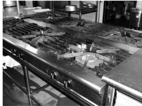
Fig. 14. Improvement in mixing food by cutting the stove legs by 7 cm and lowering the stove.