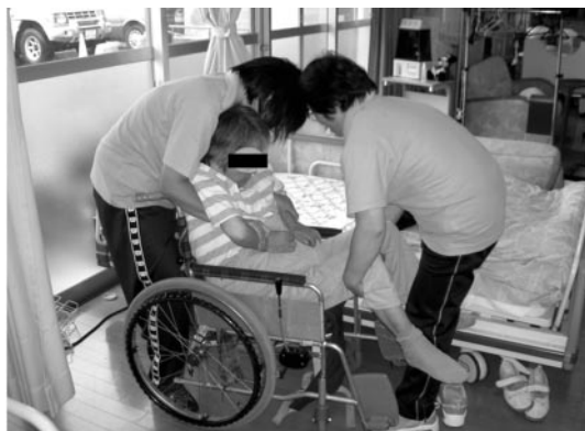
Fig. 3. Transferring a patient between a wheelchair and a bed in a spacious area.