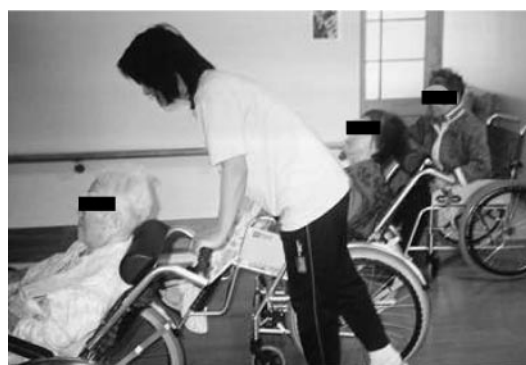
Fig. 5. Pushing two wheelchairs in a bending posture.