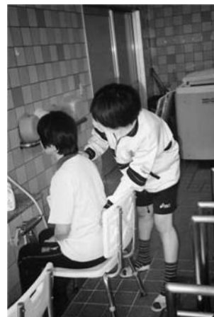
Fig. 4. Washing patient's body in a bending posture.