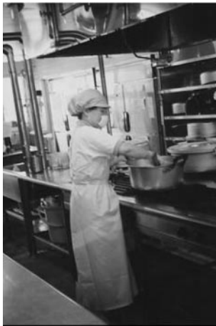
Fig. 8. Mixing side dish in a bowl in a high position.