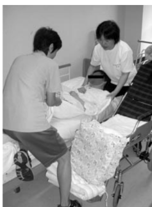
Fig. 2. Transferring a patient between a wheelchair and a bed in a narrow area.