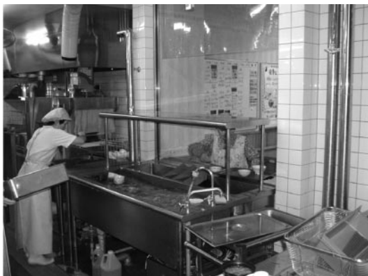
Fig. 9. A bad arrangement of a sink and a dishwasher.

using a care lift, the load of lifting patients is reduced.