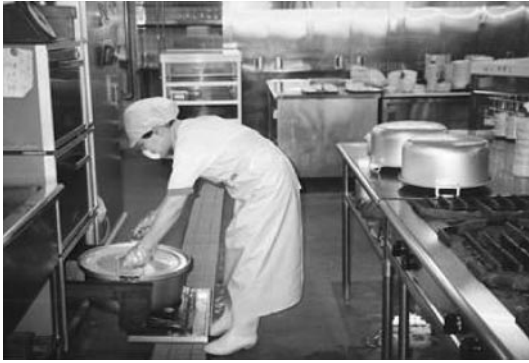
Fig. 7. Handling a heavy rice-cooker.