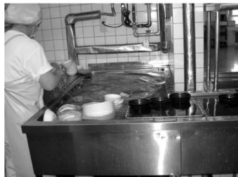
Fig. 15. Improvement of the returning dish sink. Before improvement (top)—the sink is separated into two parts and are not directly connected to the dishwasher. After improvement (bottom) two separated sink is connected into one and the end of the sink is connected to the dishwasher.