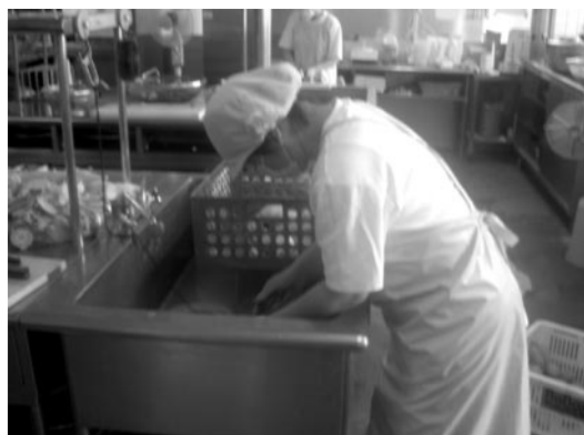
Fig. 6. Washing vegetables in a bending posture.

with the dishwasher. Therefore, they transfer the dishes from the first sink to the second one and then from the second sink to the dishwasher.