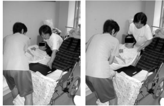
Fig. 10. Improvement in transferring patients by using a sliding board.